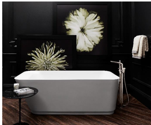
The contemporary DXV Modulus freestanding tub exhibits functional elegance with its softly angular design lines, ideal for deep soaking luxury with its 81-gallon capacity.

With a pared down and fundamentally modern aesthetic, the DXV Modulus one-piece toilet features a slim, high back tank and an angular, monolithic design. Completing the offering are the compact DXV Modulus wall mounted toilet and bidet models , ideal for smaller spaces. Both fixtures feature clean, concealed tank designs that incorporate the exclusive GROHE Rapid SL in-wall carrier system . The actuator plate for the wall mounted dual flush toilet and the minimalist single-hole bidet faucet is offered in a choice of polished chrome, brushed nickel and polished nickel finishes.